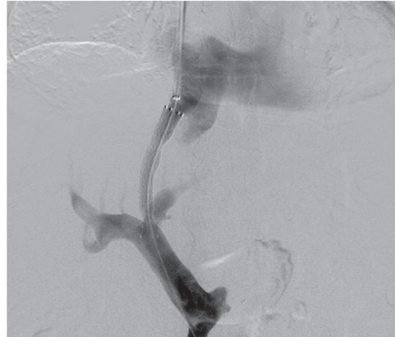
Fig. 1: Image after transjugular intrahepatic portosystemic shunt procedure (8-mm diameter, 60-mm long covered stent was successfully inserted).

Twenty days later, the GI bleeding did not improve and existed persistently. Finally, TIPS (using an 8-mm diameter, 60-mm long covered stent; Fig. 1) was performed followed by CVVH. Two days after the procedure, the GI bleeding was completely alleviated and abdominal circumference dropped to 116 cm with normal liver function. The patient was discharged with maintenance haemodialysis (four hours of haemodialysis three times per week).